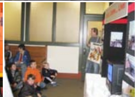
Chicago South Shore & South Bend Railroad hosted an Operation Lifesaver event March 20.